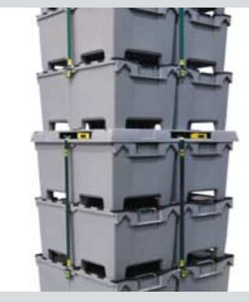
Location points for secure double stacking in storage/transit