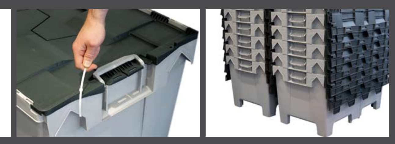
Lockable lid for complete product security