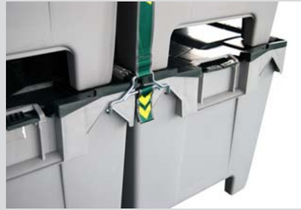
Hook secures boxes as one unit load