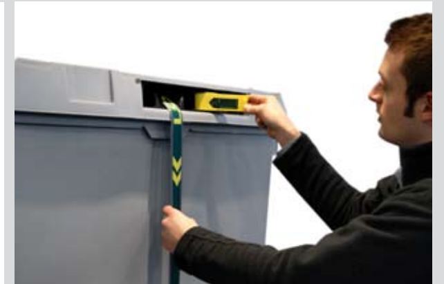
Simple ratchet in lid to tension and release load