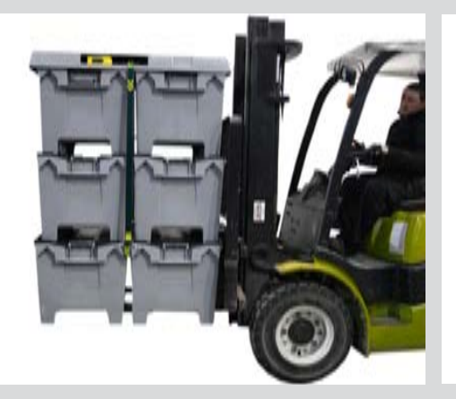
Six loaded boxes handled in one movement